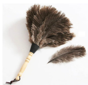
Ostrich Feather Duster